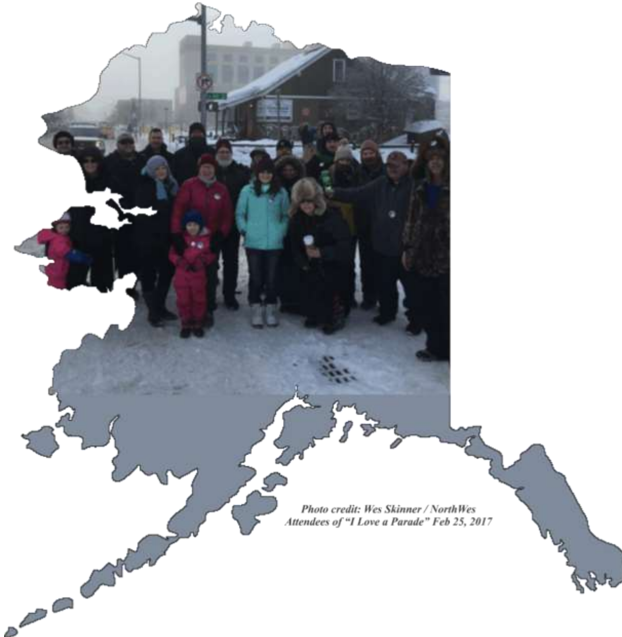
Attendees of "I Love a Parade" Feb 25, 2017