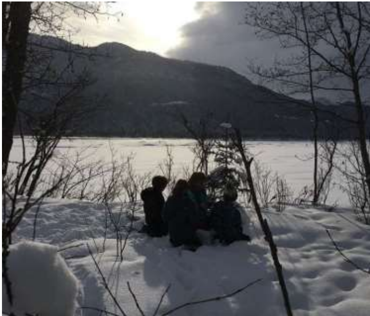
A student team at one of their cache sites on the Reflection Lake Trail

The final session found the volunteer team at Palmer Hay Flats State Game Refuge's Reflection Lake trail an hour before students were to arrive. Mrs. Brown had scouted another eighteen 'cache' sites, and led the effort to place the eighteen containers in advance of students arriving on site. When the bus pulled up and disgorged the classes, everything was ready for an 'in the wild' experience that found the small four-person teams (each with an adult escort) ranging independently along the trail around the lake. They were to find their six assigned 'cache' sites and perform the assigned tasks found in each container. It was fun to be outside on the trail this day following a fresh four-inch snowfall, hiking in bright sunshine with temps in the twenties, making for a genuinely delightful winter caching afternoon. These students exemplified what we ask of geocachers in general in terms of good outdoor behaviors, observing all the safety conditions they'd been taught and making sure all the gear made it back to the trailhead as planned. The CITO ethic was introduced and resulted in a small amount of trash getting picked up too. Students averaged about two miles of hiking in the snowy trail conditions, and all were dressed to be comfortable outdoors.