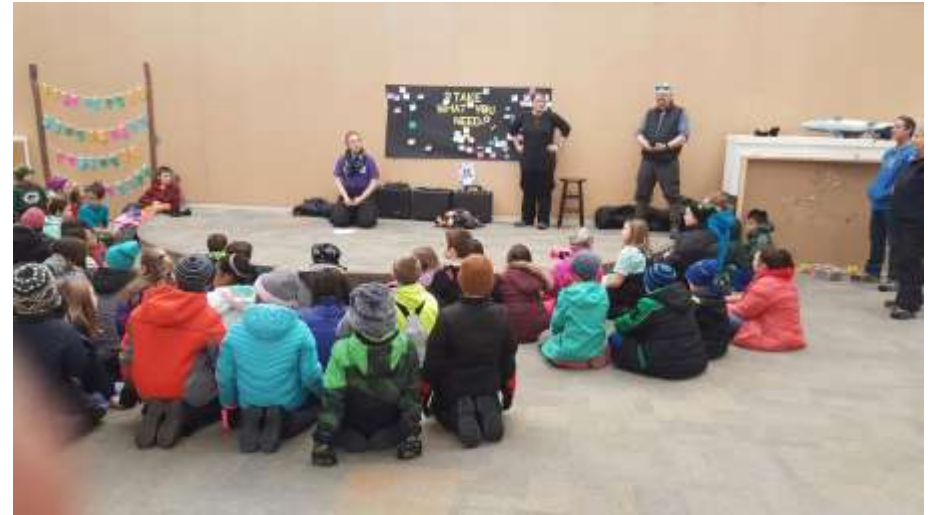
Getting ready to get outside during the second session – as one class prepares to receive their Garmin eTrex GPS units for the first time

program the legacy eTrex units could 'talk' to) and teaching students how to use a computer to cross-load the coordinates onto their units. Each student was equipped with their own GPS unit for sessions 2 and 3.