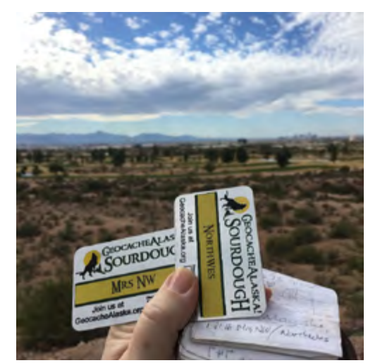
<u>GC387</u> 'Back in the Saddle Again' – found by Sourdough Members of GeocacheAlaska! Inc, - with Phoenix on the horizon.

taught us how South Mountain differed from Camelback and the other peaks scattered around the north side of Phoenix. Just a mile further east along the ridgetop we came to what turned out to be the best cache of the day - an old-style letterbox hybrid. The walking directions took us several hundred yards back and forth across one of the valleys on South Mountain's north side, ending up atop the next ridge away. Our path followed the barely-visible remnants of the original road across the mountain, cutting covote tracks as it wove around giant cactus and boulder outcroppings. The Sonoran desert bioclime was fascinating to hike across in the 72 degree sunshine, and we lingered far longer than necessary on this one single caching journey to soak in the desert setting. Later in the day we visited the Desert Botanical Garden, set in one corner of the vast reaches of Papago Park near the Phoenix Zoo. As the sun set our day was capped by the antics of a half-dozen hummingbirds chasing each other in their frantic efforts to make the most of all the desert flowers in bloom at the garden.