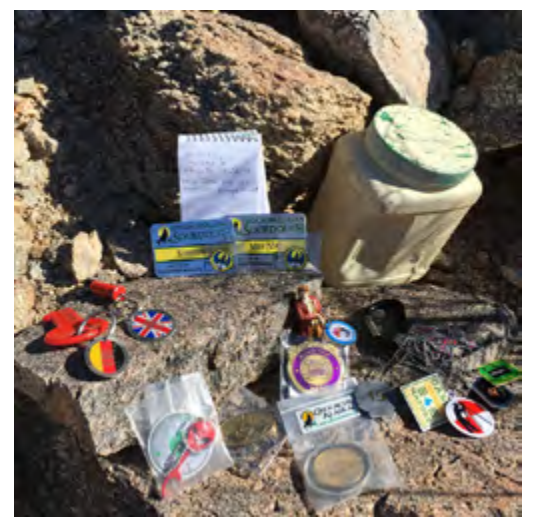
Travel Bug photo time at <u>GC28FQM</u> 'SMHIC #4 – Follow the Old Road' one of our best cache journeys ever!