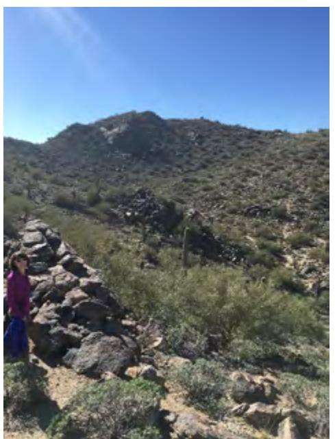
Mrs NW looks back across to the main ridge atop South Mountain from letterbox geocache <u>GC28FQM</u>

We managed a decent sleep on the redeye flight, and after picking up our rental car we headed out right at sunrise for South Mountain (oddly enough, located on the south side of Phoenix). A two-lane paved road wound its way up two thousand feet of elevation gain to a stunning view across the entire valley. Dodging packs of bicyclists, our route took us all the way up to a stone lookout built by Civilian Conservation Corps workers back in the 1930s. This location featured an earthcache, which