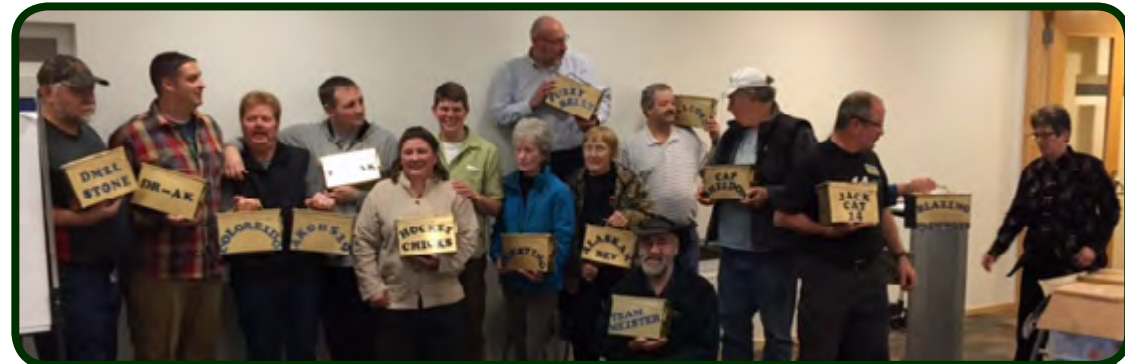
Most of the honorees at this years Golden Ammo Can Award ceremony!