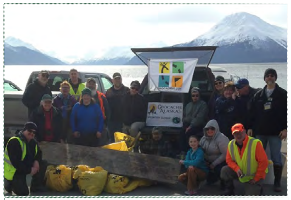
Attendees at one of the most beautiful CITO locations anywhere worldwide!

it is nice to see our efforts making a difference in keeping this beautiful area kept relatively free of trash. Our first effort here several years ago completely filled three pickup trucks with trash bags, so we know geocachers are making a positive impact along the highway!