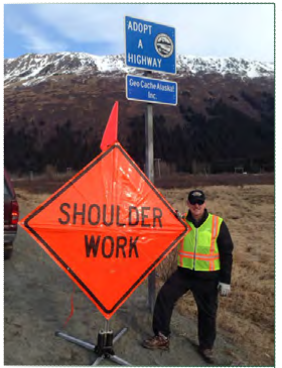
NorthWes sets up for the CITO

April 25, 2015 marked the kick-off of the World-Wide CITO weekend, and twenty-five cachers arrived to scour the first three miles northwest out of Girdwood along the Seward Highway. GeocacheAlaska! Inc. sponsors three cleanups a year along this section of the highway in partnership with the Alaska Department of Transportation. AK DOT provides safety gear and trash bags, the Municipality of Anchorage provides free trash drop-off at the Girdwood Waste Transfer facility, and cachers provide the peoplepower to help keep this incredibly beautiful part of the Scenic Byway sparkling clean.