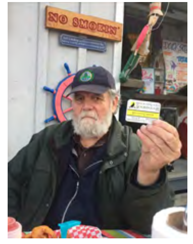
Student Camper with GeocacheAlaska! nametag!