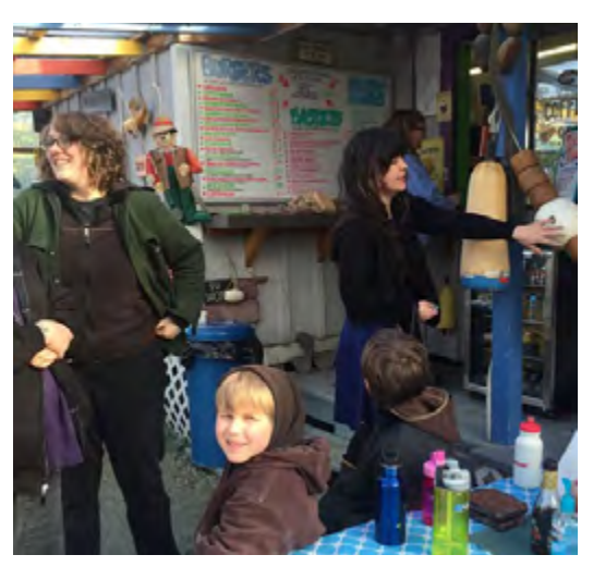
Wild Child AK and SCARLY<3Rellimer13 with their kids