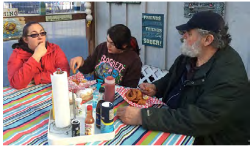
KetchGirl and Student Camper

Luckily for Ketchikan we have some very talented puzzle cache makers. Ketchikan has several Mystery Caches but we had two new special caches hidden to help us celebrate! GC5PBTQ Knotty created and hidden by Wild Child AK and GC5PBVG Mystery divided by ? = ? created and hidden by SCARLY<3Rellimer13 were kind enough to create and hide 2 new and very different but extremely fun puzzle caches to help us earn the Cache Pi Day Souvenir.