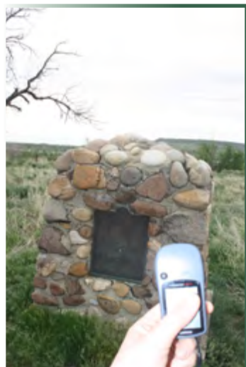
Ghost 14 - Arapahoe City