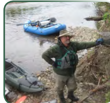
Mr Alaskache