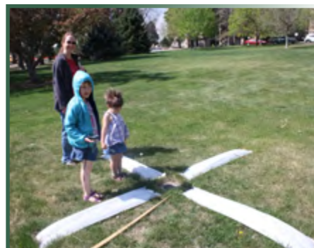
X does indeed mark the spot!