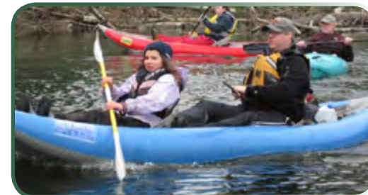
Motorin' down the river