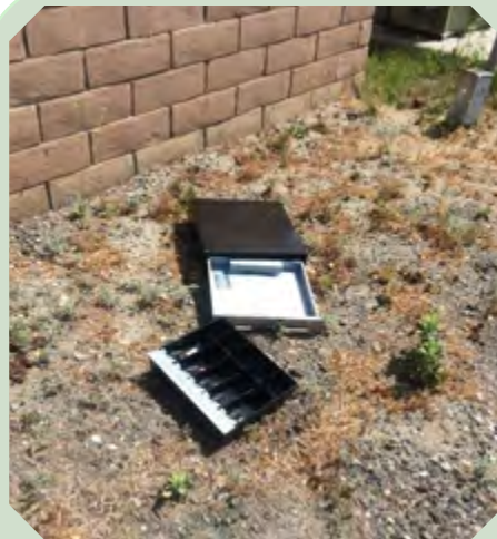
Stolen cash register drawer