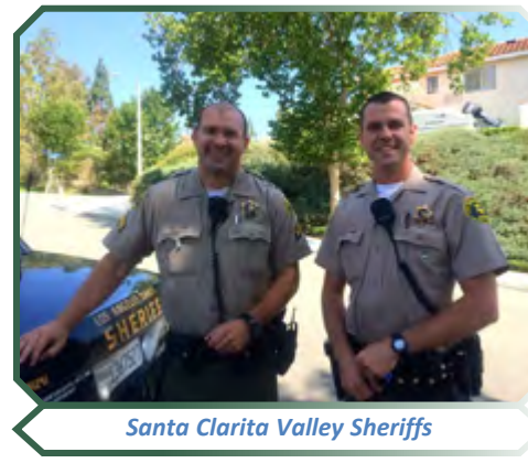
Santa Clarita Valley Sheriffs