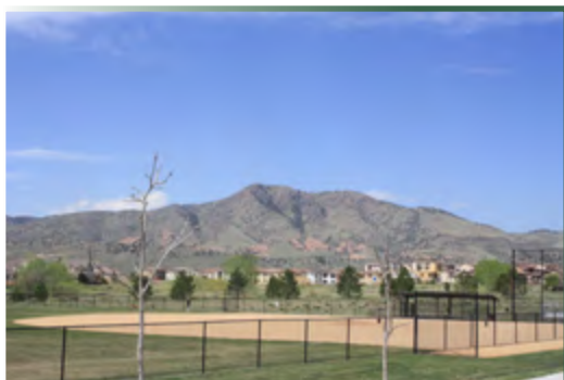
Foothills Battleship - A3 GZ lies beyond the field.