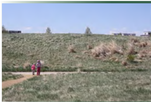
Not finding caches in Stapleton's Central Park.

Just over 24 hours after our flight from Minnesota landed in Colorado, we met up with a hiking group that we used to hike with back when we lived there. It was great fun - and that night's "hike" was more of a walk, and in a park I'd never explored! And hooray for me, there were caches here, too. KP-X and Stealth Cache made for quick finds where no one in the group even noticed what I was doing. Pioneer Village was a bit off trail, so I hung back a little before searching. I found it easily, but then a gust of wind blew the log and proxy TBs out of my hands and toward the pond. I'm sure I made quite a sight dashing around grabbing little pieces of paper. At this point I was well behind the group, but I just had to try for one more. Growing up on the 105 was a clever hide, which didn't take me long once I looked around and really thought about where you could put a cache on this busy trail. I walked quickly to catch up with the crew and had fun telling them about what I had been doing.