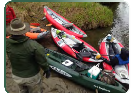
A jumble of boats!