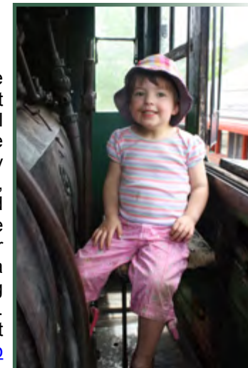
Engineer in training