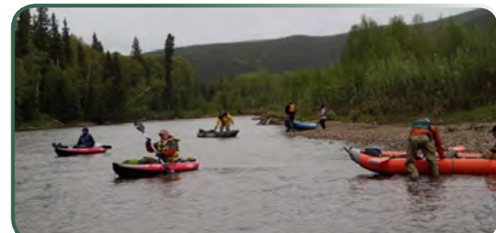
Got this one! Off to the next!