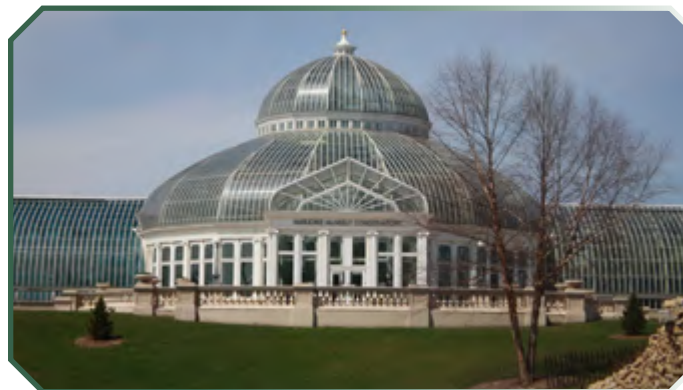
Marjorie McNeely Conservatory

After doing a great CITO, the kiddos were ready for the zoo, so we dropped off our trash bags and went to find some animals. We toured the zoo for a while, and then had a picnic lunch, after which