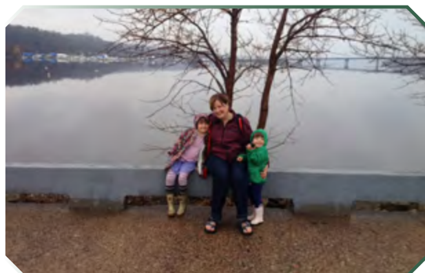
Lake St. Croix - A Wide Spot in the River

solved for correctly, but the little one was cold and had to use the potty by then, so when we didn't find it right away, we decided to come back another time. We met an old friend of mine, his wife, and new little one for lunch, before wandering off to find some caches while walking off the pizza and ice cream lunch. We started with Lake St. Croix ~ A Wide Spot in the River , which was a neat earthcache.