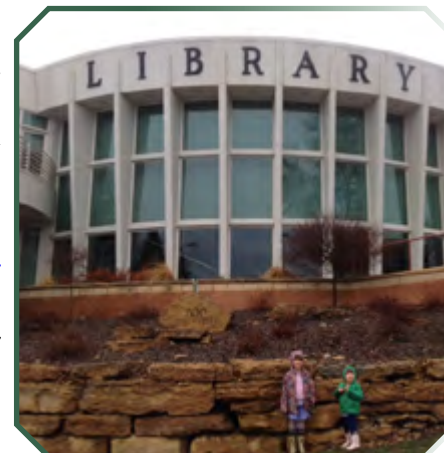
Hudson, Wisconsin Public Library Expand Your Horizons!

The water was higher than normal, so it was an interesting exercise to try to determine the width of the channel. (My darling husband made sure to inform me that if he had a rangefinder, the task would have been much easier!) Then while he and the girls went to play on the sand for a few minutes, I slipped over to make a quick find of Hudson's Bridge to MN on the Yellowstone Trail . It was starting to rain again as we walked back, so we decided our last cache attempt for the day would be, Expand Your Horizons , a puzzle at the library! After making the actual find more challenging than it needed to be, we signed the log and headed back to the rental geo-rig and aimed for dinner back across the river.