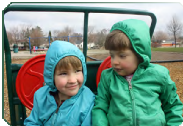
Okay, so next time the 2 year old gets the GPSr!

After our fun over in Wisconsin, it was time to get back to wedding preparation. One of my tasks was to get the girls in for haircuts! We made appointments at a place just for kids. Well, they were in and out in short order, so we headed over to a nearby park to play for a while. They were having such fun and didn't need my intervention, so guess what? I pulled up my caching app and sure enough, there was a cache in the park! As the girls were starting to tire, I called them over, handed my 5 year old the GPSr, and told her to go find the cache. She oriented herself, and led us to a tree area. In the end, I made the actual find of Welcome To The Hive , but she had led us to GZ with no trouble!