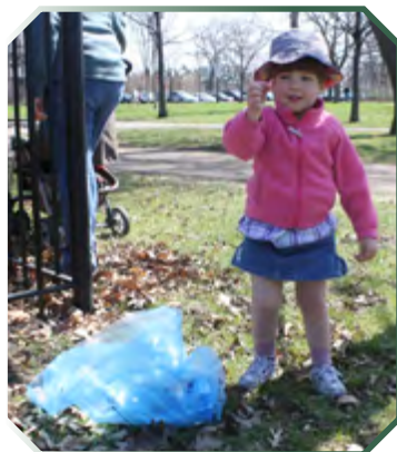
Little Bits of Trash