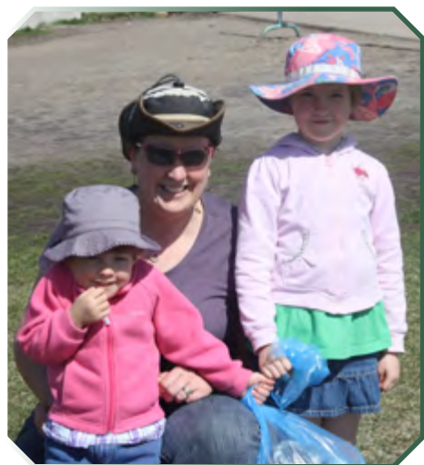
The_Firefly & Little 'Flies

clean up of the park, so it was pretty clean for the most part. Still, in about an hour of cleaning, we found lots of small bits of trash.