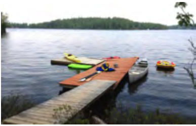
GZ across the water.jpg