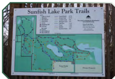
Lots of caches here!