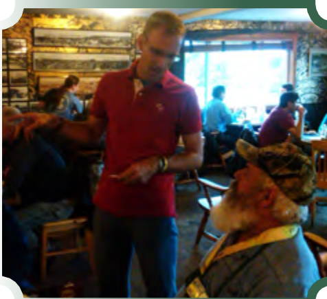
Hans of Dhaulaghiri and cavyguy meet and greet!

five personal pathtags, Capsheldon added a micro geocoin and TeamDJM tossed a super cool looking Alberta Badlands geocoin onto the pile. Many thanks for your generous contributions!