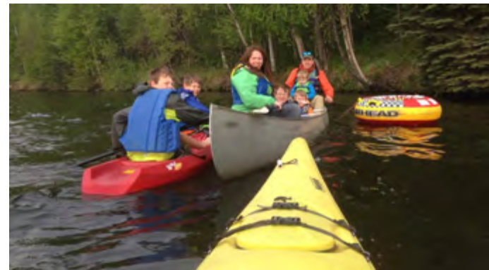
Departing the GZ.JPG