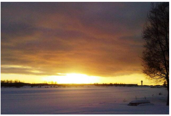
Sunset at Lake Hood near Sugar-A Tribute to Our Caching Buddies

Previous editions of "Around the State" are now on our website. If you have missed previous newsletters, check out the series (including previous Trail Reports) <a href="https://here.newsletters.newsletters">here</a>.