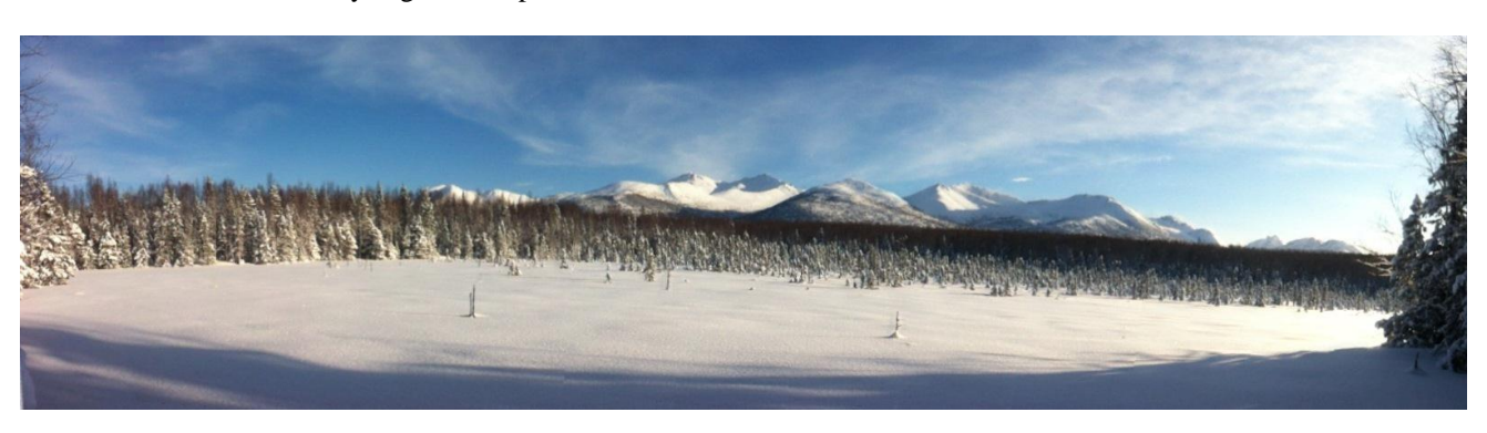
Photo below: View near <u>Quadventure's Great Adventure</u>