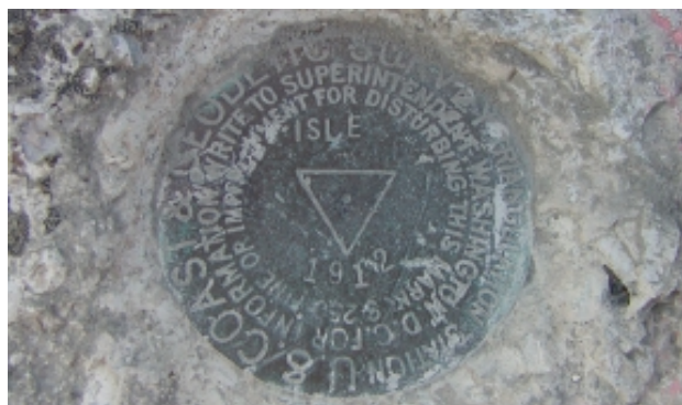
This 1912 US Coast & Geodetic Survey benchmark is one of the earliest placed along Turnagain Arm, predating construction of the railroad, the old Johnson Trail, and the founding of the city of Anchorage. This bit of history is encountered while searching for GC5583 Gilligan's... , a McHugh Creek-area geocache placed in 2002. Gilligan's is one of the geocaches found along the Turnagain Arm shoreline, easily accessible from the State Park. Here on this islet travelers once landed by boat at high tide, after crossing the Arm from Sunshine or Hope while headed north to the goldfields of interior Alaska.