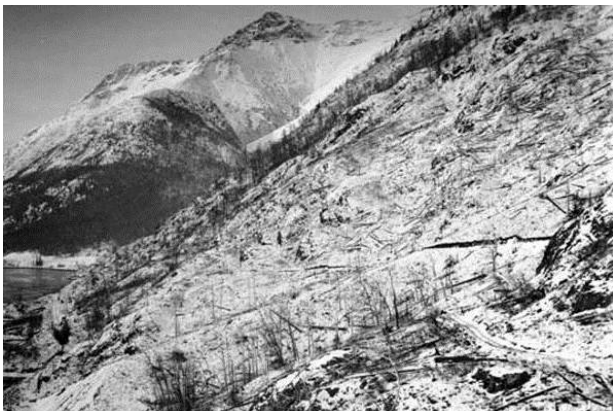
View of trail (center right) and railroad grade along Turnagain Arm, looking toward Rainbow Valley. Today's trail follows the original pathway here.

In 1915 the footpaths along this shoreline were developed into a construction and freight trail to support construction of the Alaska Railroad. The railroad grade was built just above tidewater without discernible change in elevation, as is necessary for rail travel. However, the construction trail rose and fell as needed across the hillsides and valleys to ease the passage of men, materials and draft animals. Today the Turnagain Arm Trail in most places follows the old pathway. A keen eye can make out the location of early construction camps and where the grade was cut into the hillside to make the trail wide enough for horse-drawn sledges and wagons.