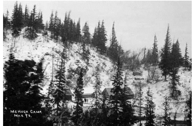
Railroad construction camp at railroad mile 96 near McHugh Creek with Turnagain Arm in background. Alaska Engineering Commission 1916 photo. Today this area is overlain by the parking and picnic areas at McHugh Creek Trailhead.

By 1918 the Alaska Railroad was completed between Seward and Anchorage, obviating the need to haul freight on the old trail. The Seward Highway was built in 1950 and paved by 1954, covering portions of the trail in places. Successive waves of highway and railroad expansion have encroached further on the trail. Several of the old work camp sites have been reworked into facilities for Chugach State Park use, most notably at the Potter Section House and McHugh.